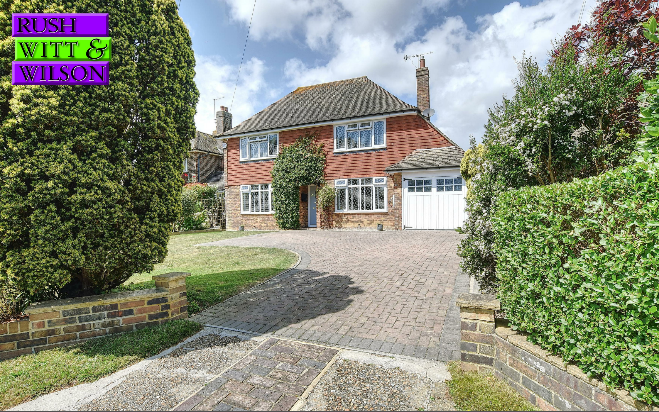
Clare Cottage, 21 Collington Lane East, Bexhill-On-Sea, East Sussex TN39 3RG £637,000